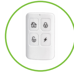
Fob Arm On/Off