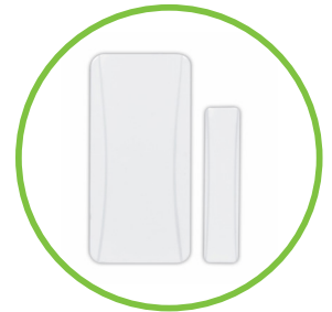
Door and Window Contact